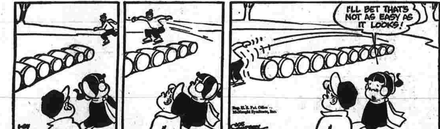
BY JOE CAMPBELL