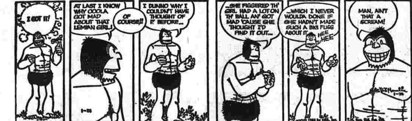
BY V. T. HAMLIN