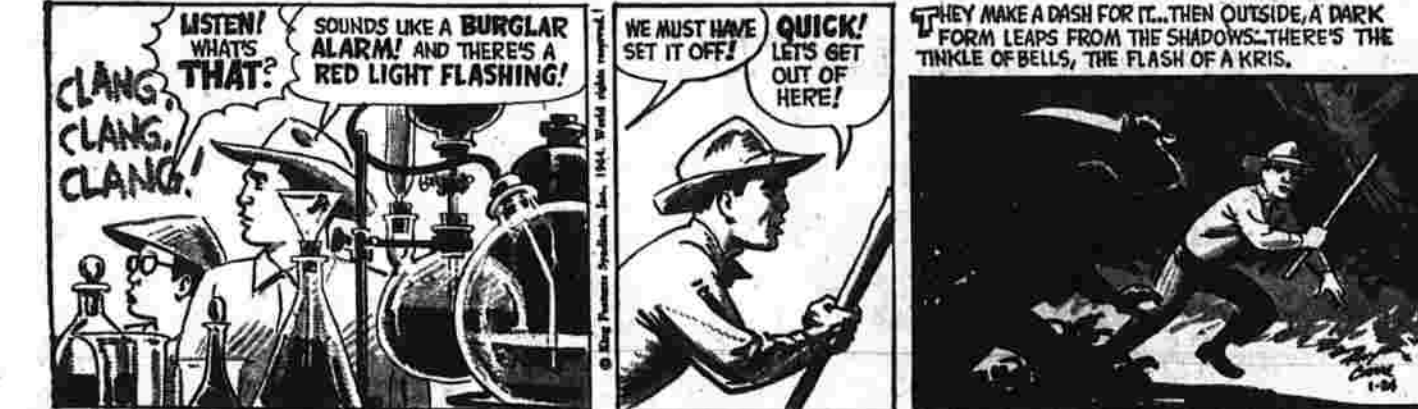
BY ROY CRANE