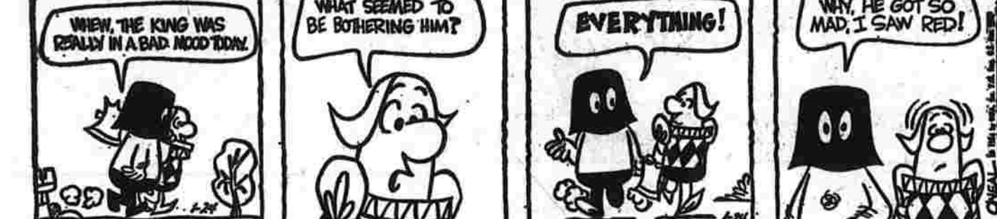
BY FRANK O'NEAL