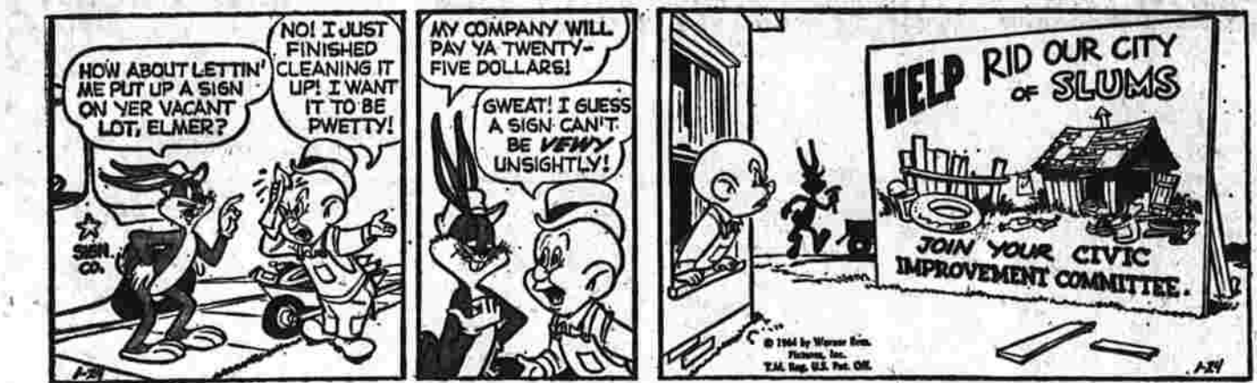
HELP RID OUR CITY OF SLUMS